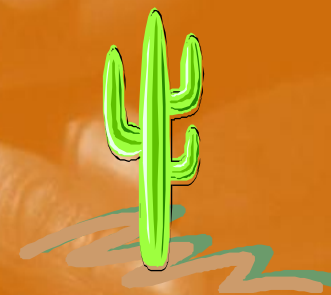
FAOV Fundación Ambiental Oasis de Vida