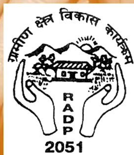
Rural Area Dev Prog (RADP) NEPAL